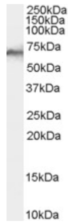
EB07725 (0.1 \mu g/ml) staining of Human Liver lysate (35 \mu g protein in RIPA buffer). Detected by chemiluminescence.