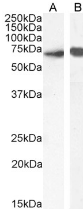
EB07725 (0.01 \mu g/ml) staining of Mouse Thymus (A) and (0.1 \mu g/ml) Rat Thymus (B) lysate (35 \mu g protein in RIPA buffer). Detected by chemiluminescence.