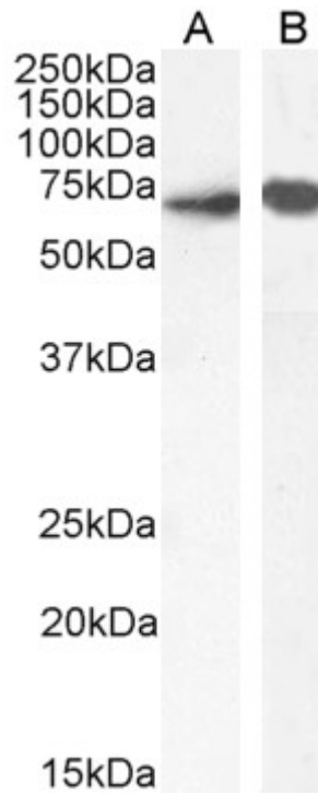
EB07725 (0.01 \mu g/ml) staining of Mouse Thymus (A) and (0.1 \mu g/ml) Rat Thymus (B) lysate (35 \mu g protein in RIPA buffer). Detected by chemiluminescence.