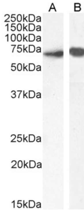
EB07725 (0.01 \mu g/ml) staining of Mouse Thymus (A) and (0.1 \mu g/ml) Rat Thymus (B) lysate (35 \mu g protein in RIPA buffer). Detected by chemiluminescence.