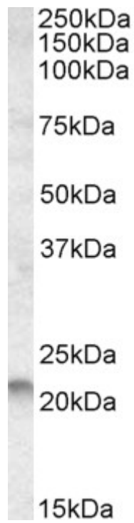
EB05314 (0.1 \mu g/ml) staining of Molt4 lysate (35 \mu g protein in RIPA buffer). Detected by chemiluminescence.