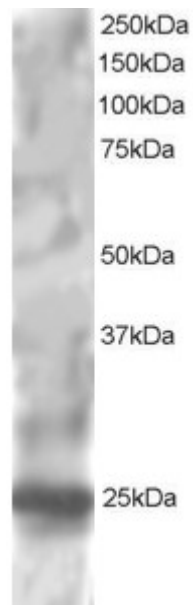
EB05421 staining (1µg/ml) of HepG2 lysate (RIPA buffer, 30µg total protein per lane). Primary incubated for 1 hour. Detected by chemiluminescence.