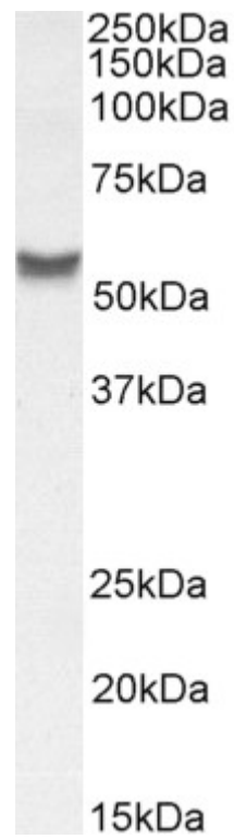
EB12063 (1µg/ml) staining of Human Placenta lysate (35µg protein in RIPA buffer). Detected by chemiluminescence