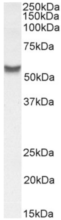
EB12063 (1 \mu g/ml) staining of Human Placenta lysate (35 \mu g protein in RIPA buffer). Detected by chemiluminescence