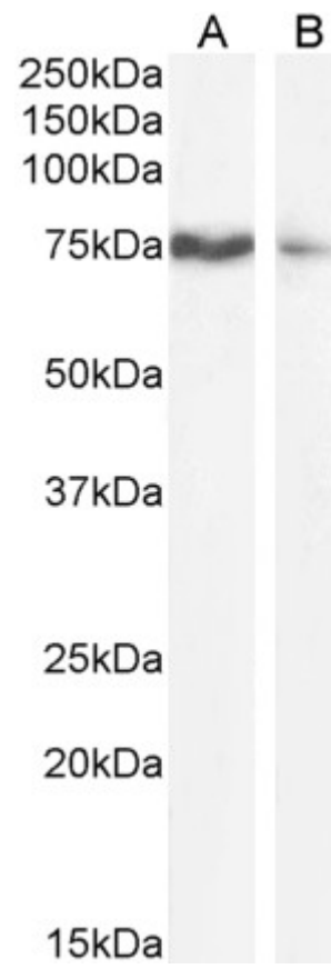
EB09685 (1 µg/ml) staining of HEK293 (A) and A431 (B) cell lysate (35 µg protein in RIPA buffer). Detected by chemiluminescence.