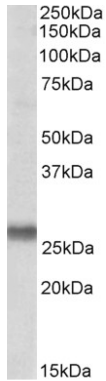
EB10232 (0.1 \mu g/ml) staining of Human Placenta lysate (35 \mu g protein in RIPA buffer). Detected by chemiluminescence.