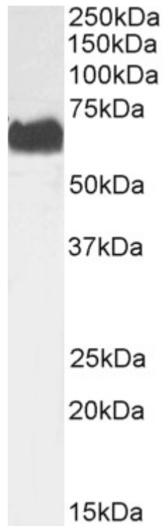
EB09416 (0.3 \mu g/ml) staining of Human Cerebellum lysate (35 \mu g protein in RIPA buffer). Primary incubation was 1 hour. Detected by chemiluminescence.