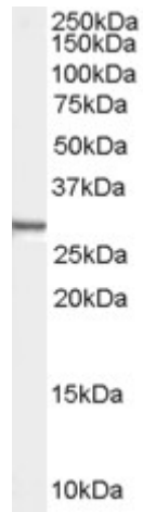
EB07470 (0.01 \mu g/ml) staining of Human HEK293 cell lysate (35 \mu g protein in RIPA buffer). Detected by chemiluminescence.