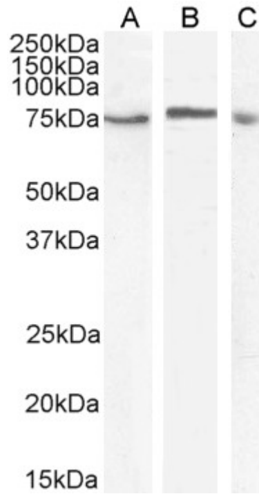
EB07264 (1 \mu g/ml) staining of HeLa (A) and U937 (B) and (2 \mu g/ml) Daudi (C) cell lysate (35 \mu g protein in RIPA buffer). Detected by chemiluminescence.