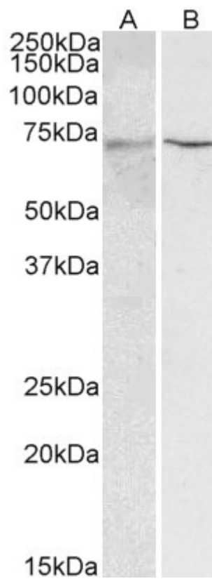
EB06701 (2µg/ml) staining of Rat Liver (A) and Mouse Liver (B) lysates (35µg protein in RIPA buffer). Detected by chemiluminescence.