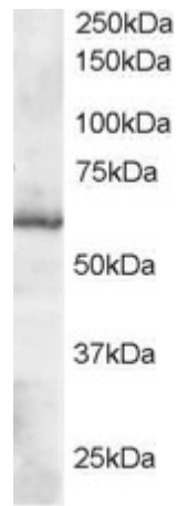
EB05510 staining (0.1 \mu g/ml) of Human Placenta lysate (RIPA buffer, 35 \mu g total protein per lane). Primary incubated for 1 hour. Detected by chemiluminescence.