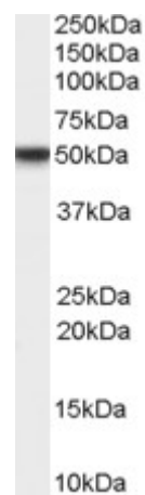
EB05048 staining (0.3µg/ml) of HeLa lysate (RIPA buffer, 35µg total protein cells per lane). Primary incubated for 1 hour. Detected by western blot using chemiluminescence.