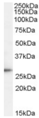
EB08024 (1 \mu g/ml) staining of Human Lymph Node lysate (35 \mu g protein in RIPA buffer). Detected by chemiluminescence.