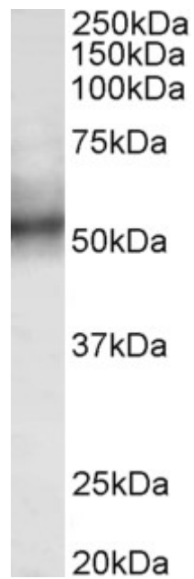
EB11287 (0.3 \mu g/ml) staining of Human Spleen lysate (35 \mu g protein in RIPA buffer). Detected by chemiluminescence.