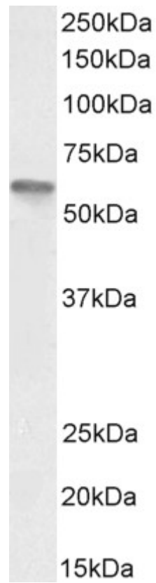
EB06803 (3 \mu g/ml) staining of U937 cell lysate (35 \mu g protein in RIPA buffer). Detected by chemiluminescence.