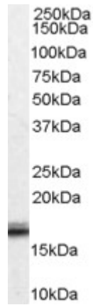
EB07333 (0.01 \mu g/ml) staining of Human Ovary lysate (35 \mu g protein in RIPA buffer). Detected by chemiluminescence.