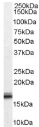
EB07333 (0.01 \mu g/ml) staining of Human Ovary lysate (35 \mu g protein in RIPA buffer). Detected by chemiluminescence.