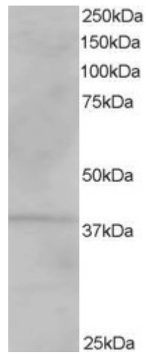
EB06256 staining (1µg/ml) of Human Kidney lysate (RIPA buffer, 35µg total protein per lane). Primary incubated for 1 hour. Detected by chemiluminescence.