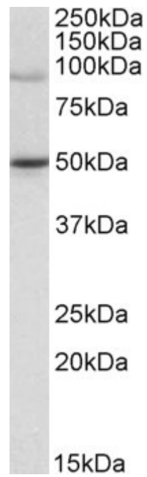
EB05132 (1 \mu g/ml) staining of Jurkat lysate (35 \mu g protein in RIPA buffer). Primary incubation was 1 hour. Detected by chemiluminescence.