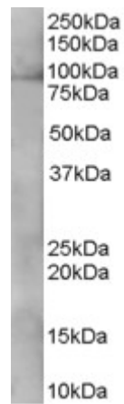
EB05062 staining (0.3µg/ml) of A431 lysate (RIPA buffer, 35µg total protein per lane). Primary incubated for 1 hour. Detected by western blot using chemiluminescence.