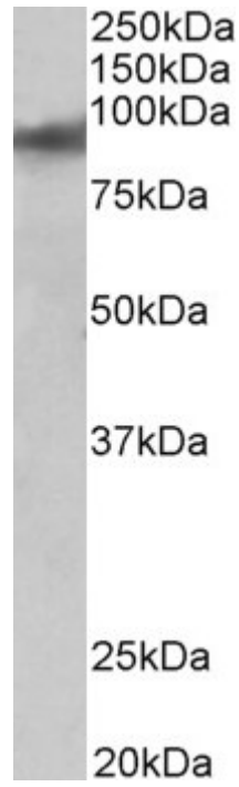
EB11188 (0.01µg/ml) staining of Human Heart lysate (35µg protein in RIPA buffer). Detected by chemiluminescence.